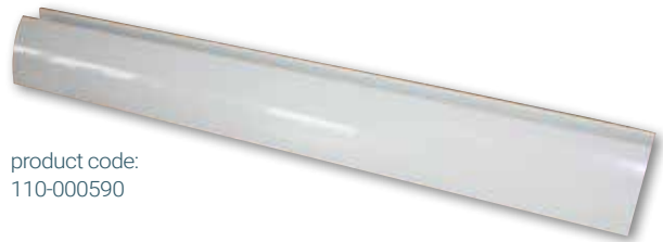
product code: 110-000590