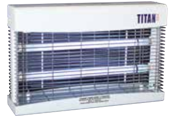
product code: 120-000050

Cluster flies are very annoying, but do not contaminate human food. As temperatures drop, flies invade structures to over-winter. On sunny days, flies are observed on western and southern windows, and within structural spaces. During brief activity, flies exhaust their energy and then spin on surfaces.