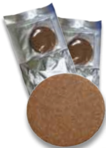
product code: 110-000606